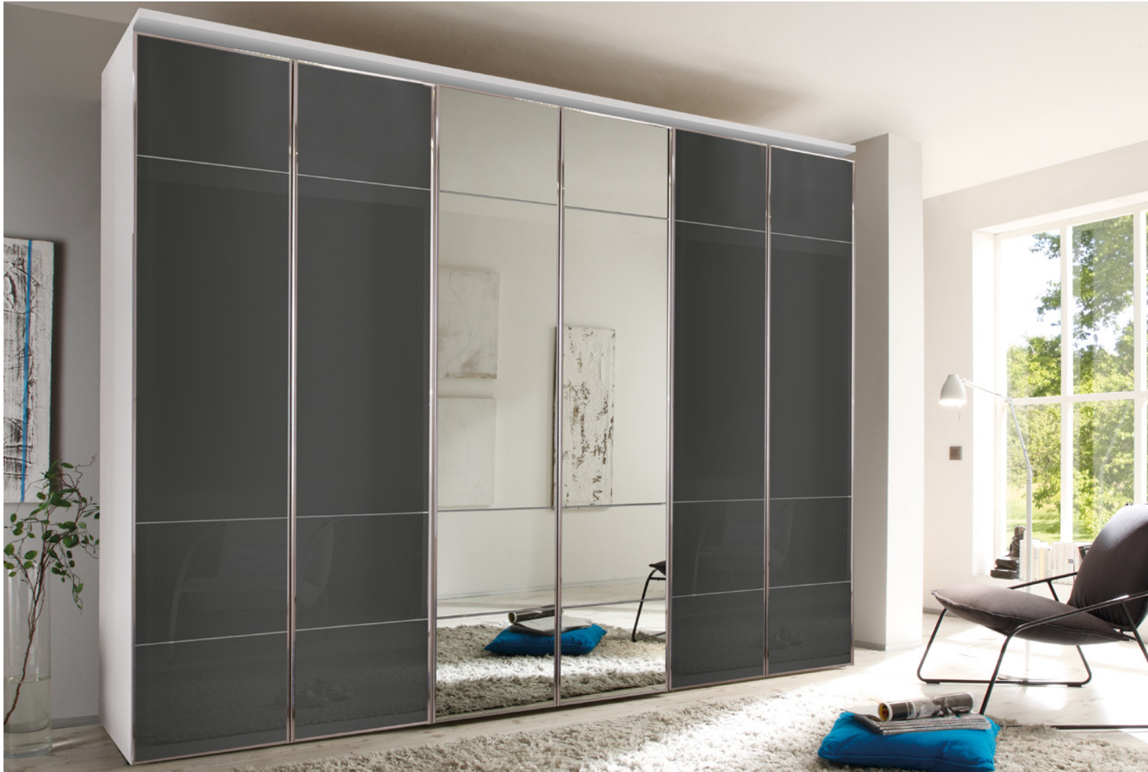
Hinged door wardrobes Version 111-119 in carcass Decor White, front Anthracite Glass/Crystal mirror, Chrome-coloured handles and trims narrow. Crown without lighting.