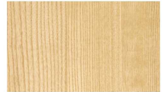
Straw (ST) Ash