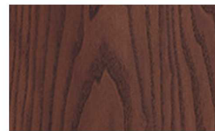
Dark Wood (DK) Ash