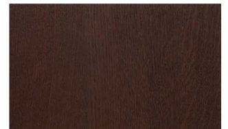
Dark Wood (DK) Oak