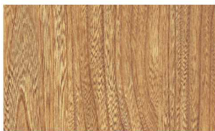
Light (LT) Ash