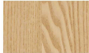
Oak on Ash (OA) Ash