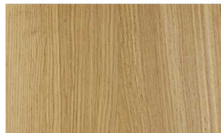
Clear Matt (CM) Oak