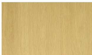
Dead Matt (DM) Oak