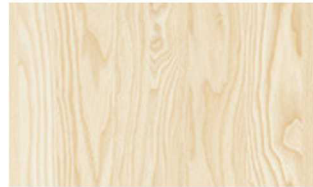
Clear Matt (CM) Ash